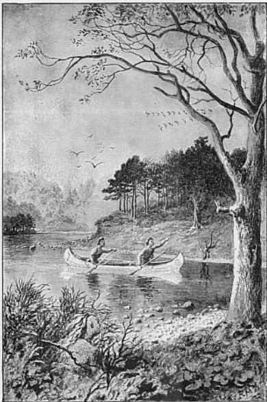
ARCHIE OUTWITS THE REDSKIN.—PAGE 244. (Frontispiece.)

steer to now? I'm tired o' steering among the reeds. Let us push out into the clear water."