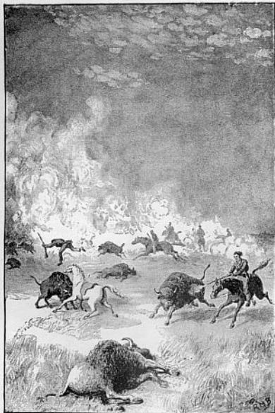
THE CHASE,—PAGE 180.

Still the horsemen—each armed with the muzzle-loading, single-barrelled, flint-lock gun of the period—advanced cautiously, until so near that the animals began to look up as if in surprise at the unwonted intrusion on their great solitudes.